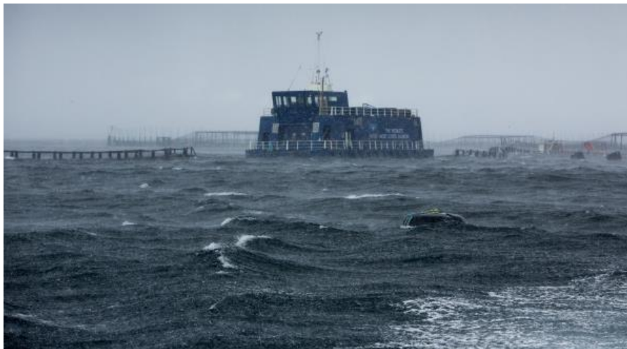
An offshore aquaculture installation.

Further information can be found on the BECRC website.