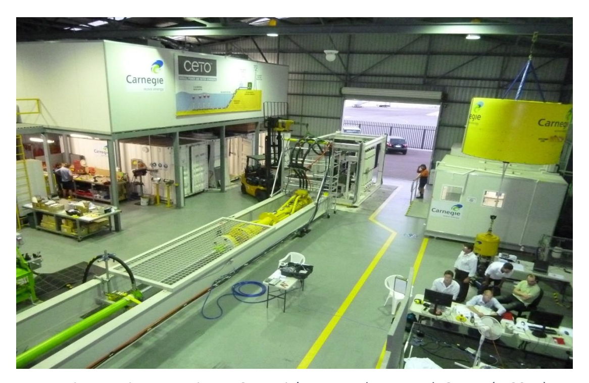
Previous testing campaign at Carnegie's Fremantle Research Centre (c. 2011)

The DHIL platform combines two test rigs. One rig is for testing the drivetrain from the input mechanical force to grid compliant power in linear or rotary cases. The second rig is for testing structural components, seals and mooring lines, in dry or wet environments.