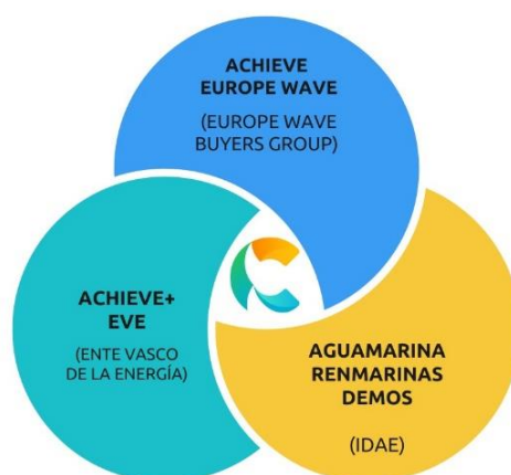
ACHIEVE Programme Schematic

The ACHIEVE Programme is an initiative being delivered by Carnegie's subsidiaries CETO Wave Energy Ireland under contract by EuropeWave Buyers Group (ACHIEVE Project) and Carnegie Technologies Spain with the support of funding awarded by the Spanish Government through the RENMARINAS Demos Programme (AGUAMARINA Project) and the Basque Government through a grant from the Ente Vasco de la Energia (ACHIEVE+ Project).