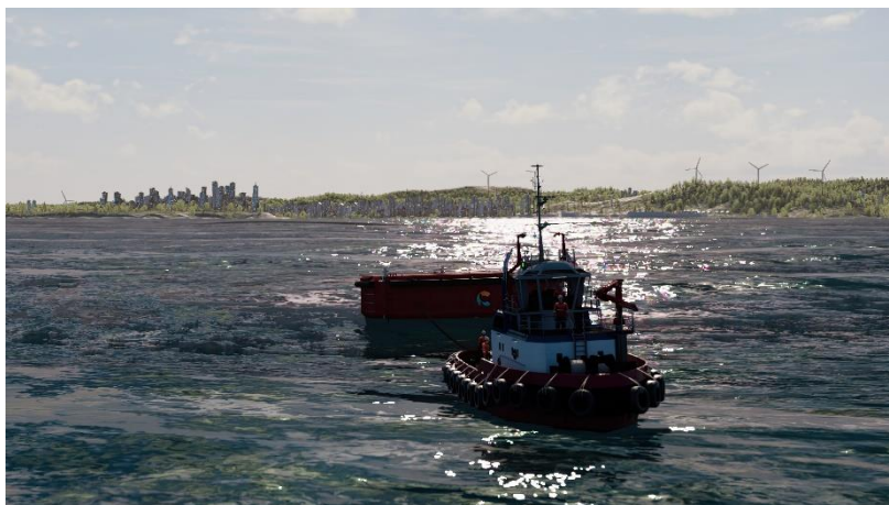
Illustration of CETO deployment

The efforts of the quarter have been primarily focused on finalising the design activities and continued procurement of key components. Upcoming activities will include the continued engagement of stakeholders and the local supply chain, alongside receipt of detailed design reports for the manufacture of critical components, which will unlock further contract payments from EuropeWave.