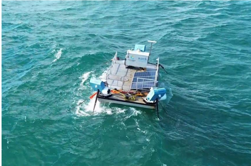
MoorPower in operation during the winter 2024 deployment phase.

The successful deployment of Carnegie's MoorPower Scaled Demonstrator in early 2024 has successfully progressed the commercialisation journey of the technology, providing an opportunity for our project partners as well as future potential customers to see the technology in action. The Scaled Demonstrator deployments provided critical data that has successfully validated the functional design and numerical modelling of the system in various sea conditions. The energy generation meeting the minimum criteria set out by the project to mitigate 50% of diesel consumption for onboard operations.