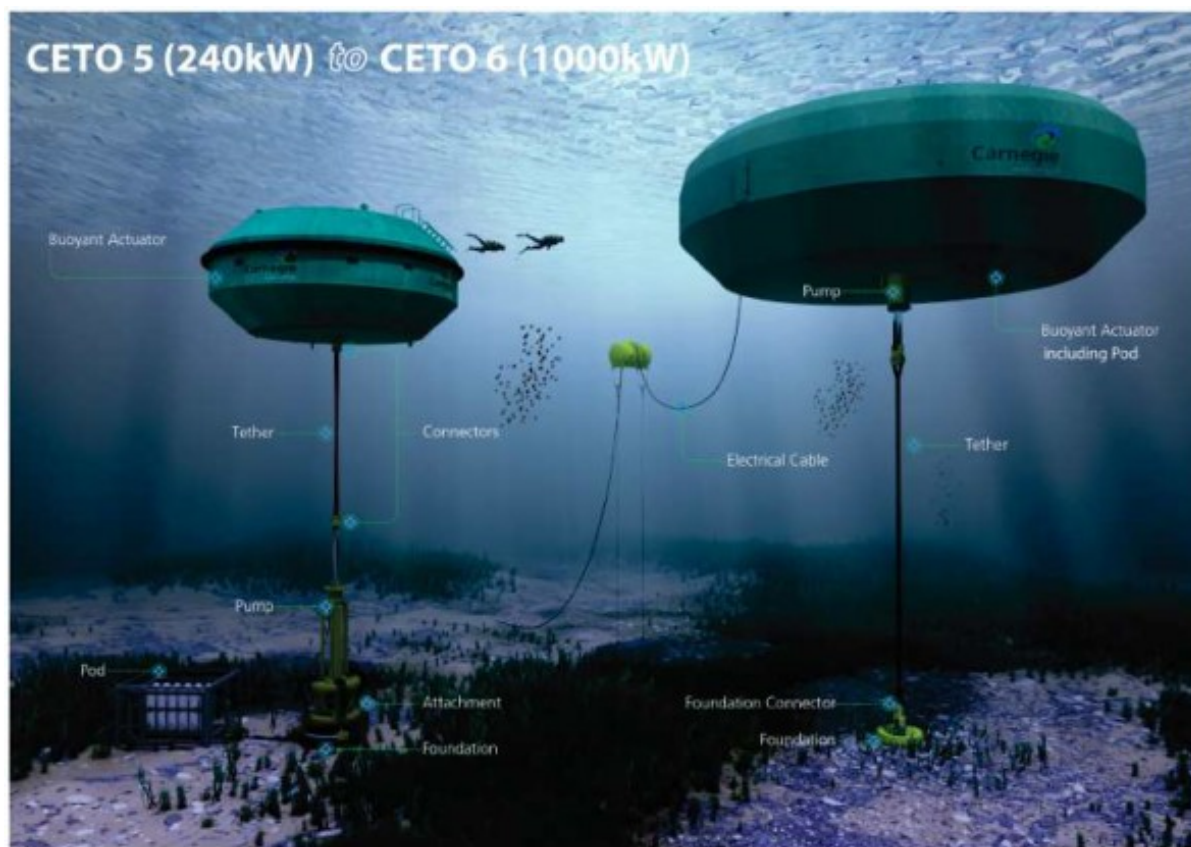
Comparison of CETO 5 & CETO 6 generations

As reported here in October last year, the CETO 6 design has a number of advantages over the CETO 5 model, including a roughly four-times increase in rated capacity to 1MW.